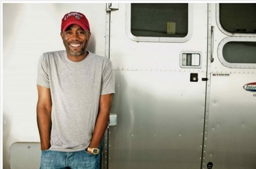
Darius Rucker

Tuesday, June 10th, 2014 | Posted by ahutchinson | no responses